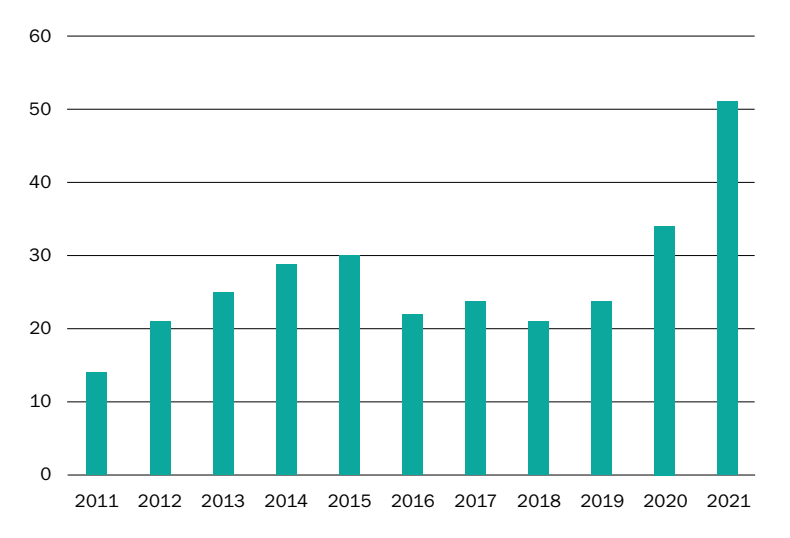
Fig. 3: Number of abstracts selected by source*